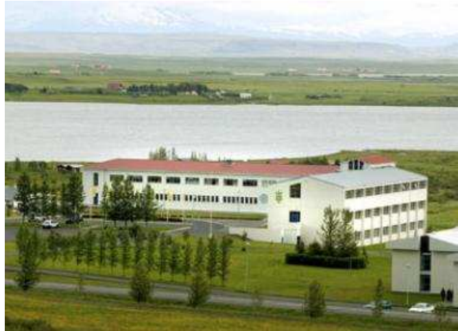
Edda ML Laugarvatn Hotel